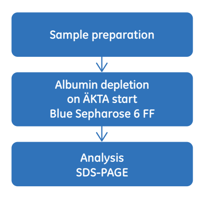
Fig 1. Workflow illustrating the steps involved in albumin depletion with a Blue Sepharose 6 FF column.

Blue Sepharose is a chromatography medium commonly used to selectively remove albumin from serum samples or culture media. Blue Sepharose 6 FF is Cibacron™ Blue 3G coupled to Sepharose 6 FF. Albumin binds to Cibacron Blue 3G, a synthetic polycyclic dye that acts as an aromatic anionic ligand binding the albumin via electrostatic and/or hydrophobic interactions. Albumin depletion in turn enriches the other serum proteins, which are usually present only in very low concentrations.